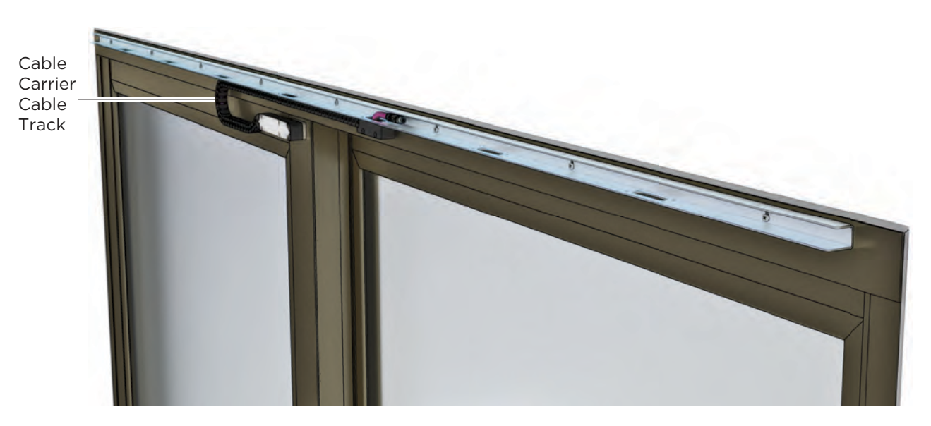
CABLE CARRIER (E) Cable Track in contracted position with door closed.