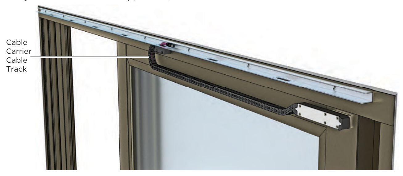
CABLE CARRIER (E) Cable Track in extended position with door open.

The Carrier Cover is not included in the following illustrations to reveal operations of the Cable Carrier. For most automatic doors with egress, the Internal Break away pivot bolt, must be modified to accommodate IGU cable.