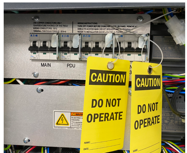
Image #2: LOTO tags applied to VIEW NET 1 - 16 and VIEW NET 17 - 32