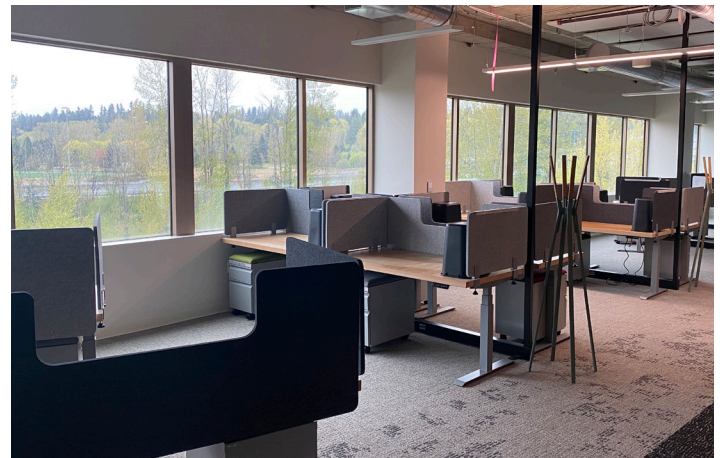
With desks perpendicular to the windows, the sun does not cause reflected glare on computer screens or direct glare into the occupants' eyes 2