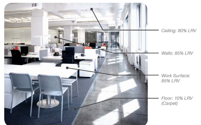
This high performance interior is designed to limit direct sun only to the transition/circulation space. Note the LRVs of the ceiling, walls and work surfaces - which help achieve maximum energy efficiency.

Daylighting and indirect lighting fixtures benefit from lightly colored interior surfaces that reflect light. An NREL report 5 on high performance buildings recommends eliminating unfinished wood surfaces, rough surfaces, and exposed ductwork. The best daylighting results were seen in spaces with light-colored interiors, smooth surfaces, and finished ceilings. Cubicle walls, furniture, and carpeting should also have light colors and highly reflective surfaces. For light shelf finishes, it is recommended to use standard white paint or clear anodized finishes.