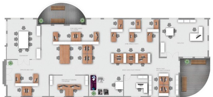
This open office floor plan has desks perpendicular to window wall to maximize occupant comfort and prevent glare 2

The optimal layout for views, daylight, and glare control is when workstations are positioned perpendicular to the windows. This minimizes the risk of the sun making computer monitors difficult to read due to either sunlight falling on the screen or due to high contrast between the monitor and a window behind it. It also reduces the potential for direct glare, which in some cases can cause safety and health issues when doing precision work 3 .